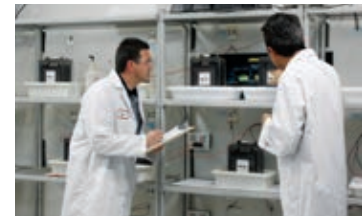
Prototype development and evaluation

To ensure the quality and superior performance of our batteries, Trojan applies the most rigorous testing procedures in the industry to test for cycle life, capacity, charger algorithms and both physical and mechanical integrity. Trojan's battery testing procedures adhere to both BCI and IEC test standards. Trojan's state-of-the-art R&D facilities include charger characterization and analytical labs, battery prototype and evaluation labs and battery autopsy centers all dedicated to providing you with a superior battery that you can rely on.